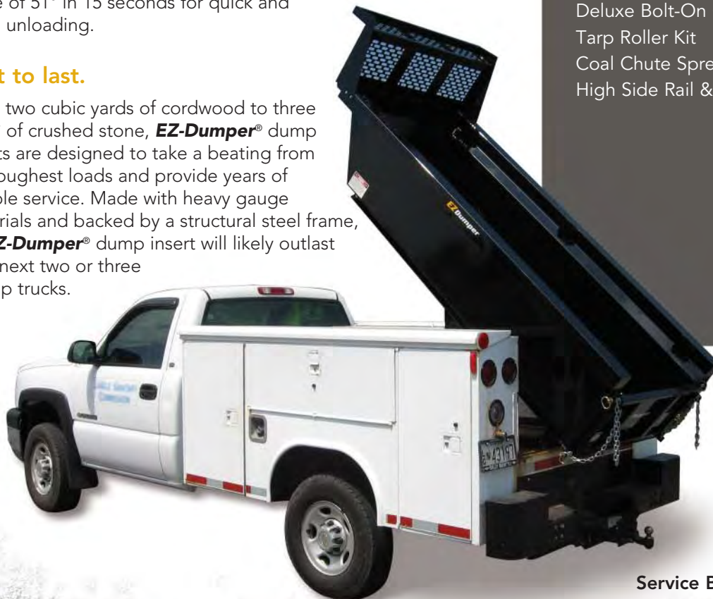
Service Body Dump Insert

From two cubic yards of cordwood to three tons* of crushed stone, EZ-Dumper ® dump inserts are designed to take a beating from the toughest loads and provide years of reliable service. Made with heavy gauge materials and backed by a structural steel frame, an EZ-Dumper ® dump insert will likely outlast your next two or three pickup trucks.