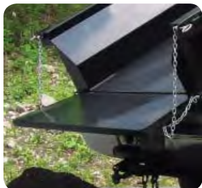
Double Acting Tailgate