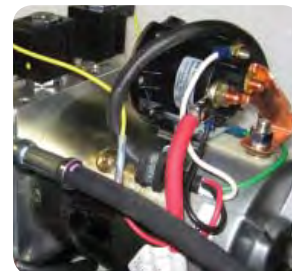
12V Electric Motor